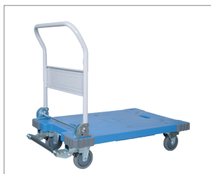
FT-300-FD (固定式手把, 脚刹式刹车)