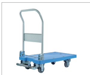
FT-150-FD (折叠式手把, 脚刹式刹车)